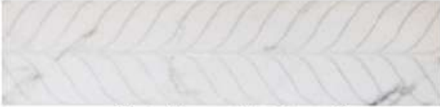
Printed Jama with white outline 15x60 cm