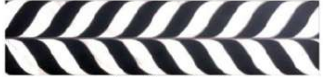
Printed Jama Satuario 15x60 cm