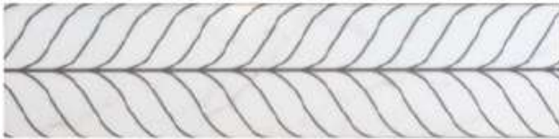
Printed Jama with grey outline 15x60 cm